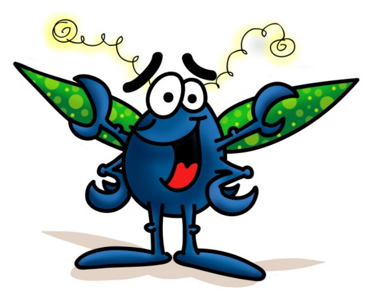
SO, WHO'S DOUG ANYWAY?

Doug is a dung beetle and proud of it. He helps clean up the land of dung - that's just a posh word for poo . Here are some more facts: